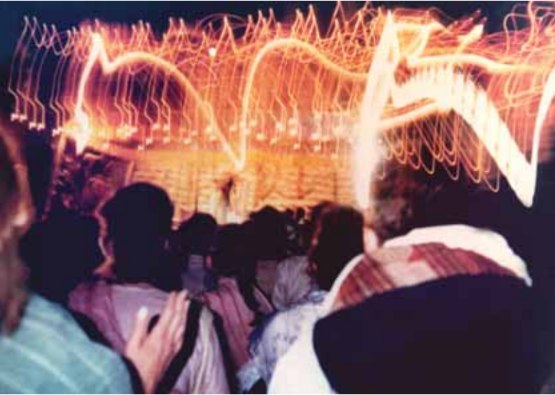
Vibrations over Sahaja Yogis during collective meditation