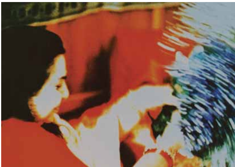
Vibrations flowing from Shri Mataji's hand