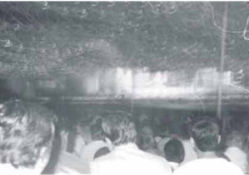
Vibrations over Sahaja Yogis during collective meditation