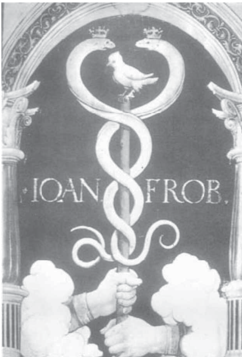
The symbol of Kundalini found in Western mythology