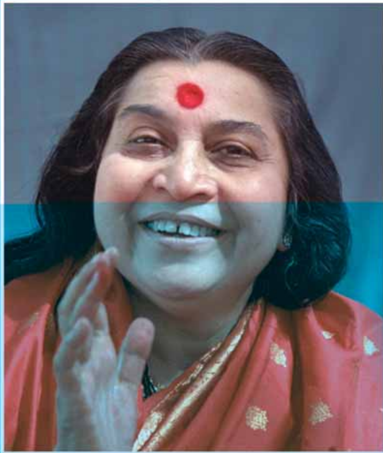
SHRI MATAJI NIRMALA DEVI

You have read one-fifth of the book Journey Within .