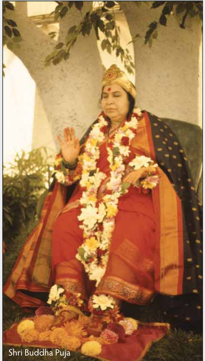
Shri Buddha Puja

The torments of modern society were read aloud. After each, all the Sahaja Yogis said aloud, “Shri Mataji, please undo the evil that man has done.” At every moment, She lifted more of the weight from our hearts, showering sweetness, assuaging the wounds and melting the ego. She has so many ways of pleasing Her children.