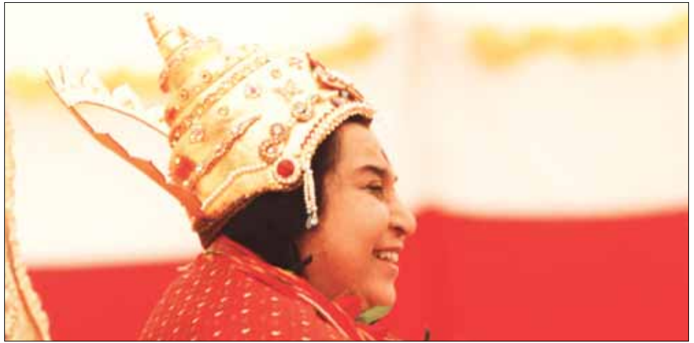
SAHASRARA PUJA • 6 MAY • FIUGGI ITALY

All these years, I have been waiting for this day. We have now the twenty-first Sahasrara Day, so is a very important turning point.