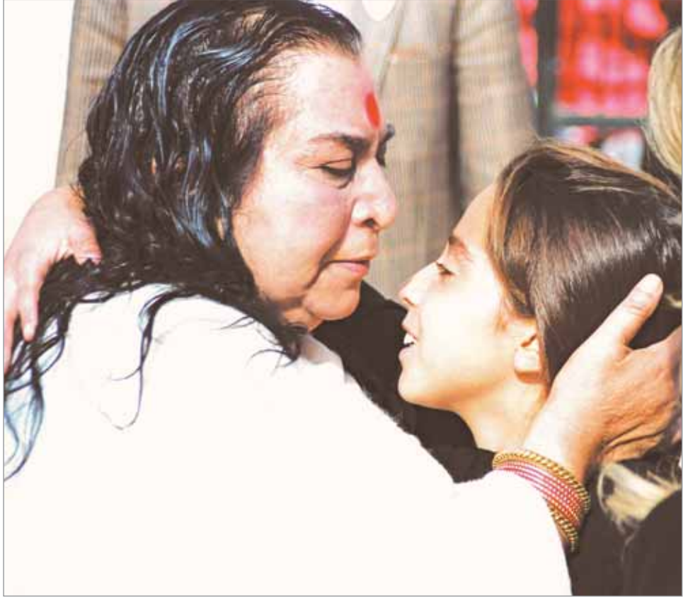
GURU PUJA • 24 JULY • CABELLA FIGURE

Guru Puja in Cabella Easter Puja in Sydney Sadashiva Puja in Delhi Sahasrara Puja in Cabella Birthday Puja in Calcutta Mahamaya Puja in Auckland Shri Adi Shakti Puja in Cabella Shri Yogeshwara Puja in the USA Shri Ganesha Puja in Moscow Shri Krishna Puja in Cabella Navaratri Puja in Cabella Shri Vishnu Puja in Paris