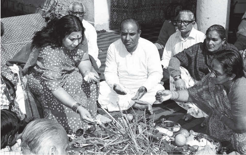
GURU PUJA • 2 DECEMBER • DOLLIS HILL ASHRAM LONDON