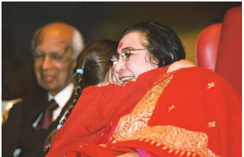
SHRI GANESHA PUJA • 14 SEPTEMBER • CABELLA LIGURE ITALY

One should look at things from Ganesha's angle. How will you do it? How will you use it? You will learn from children, how they watch things and how they work it out, how they think. You would be amazed how sensible they are and the very sensible things they say ... how innocent they are, how simple they are. They are very generous.... They are wonderful people and we have to learn a lot from children. Their smiling faces and their joy should teach us how to behave because Ganesha shines through them very clearly.