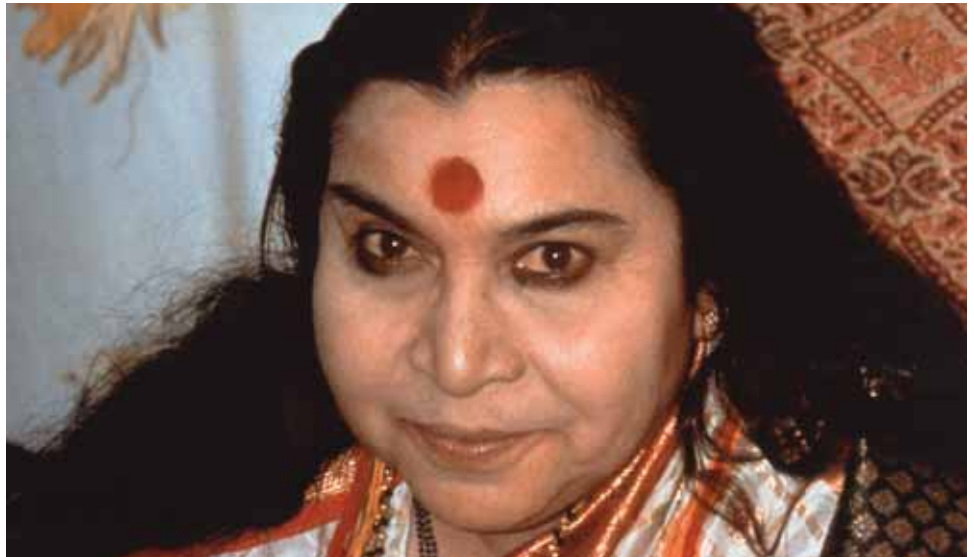
NAVARATRI PUJA • 23 SEPTEMBER • LONDON

I play with you. I always try to say things that will please you. And it should please you much more that I have said how to reach your depths, reach that gravity that will make you the gurus.... The time has come for all of you to become gurus of the right type, not with egos or talking big and creating a big show out of you, but a definite depth within you that people see that here is a beacon of Mother.... I always work through you if you are one with Me. Even when I am speaking, you are speaking. And when you are speaking, I am speaking. You know that. But with all this, that awe is very important. That gives you the love that thinks, a complete integration of your heart and your brain. The love that thinks is thoughtful.