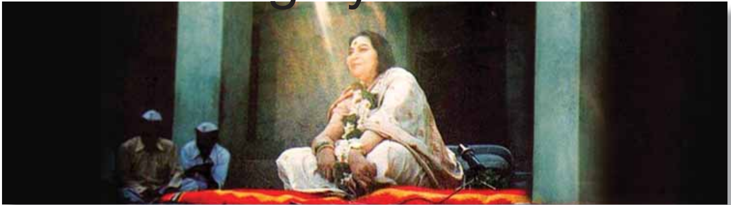
GURU PUJA • 28 JULY • CABELLA LIGURE ITALY

When our knowledge is in the brain, it is just like a film. It is away from us. It is not in our heart. But when it is in the heart, it acts, it works. It does not work through brain. In the brain it just stays, but in the heart it works. And in the heart resides the spirit.