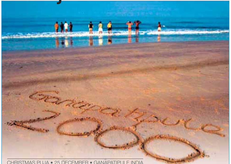
CHRISTMAS PUJA • 25 DECEMBER • GANAPATIPULE INDIA

My vision is too great for one life. I want a global Realization. I want people all over the world to have Realization.... You must try to learn Sahaj culture. In a Sahaj culture, how do we talk, how do we live, how do we contact? It is something very different. And then, once you start Sahaj culture in your life, you will be amazed – others will be amazed – how you are having rapport with each other, how you are looking after everything so well. This is the best way to live in this world – as Sahaja Yogis, where there is no ego, there is no conditioning, nothing. You are just absolutely free from all these horrible attributes and then you will be amazed how people will trust you, how they will like you.