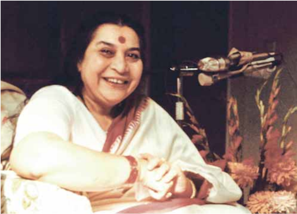
MOTHER EARTH MAHALAKSHMI PUJA • 21 AUGUST • SURBITON ASHRAM LONDON