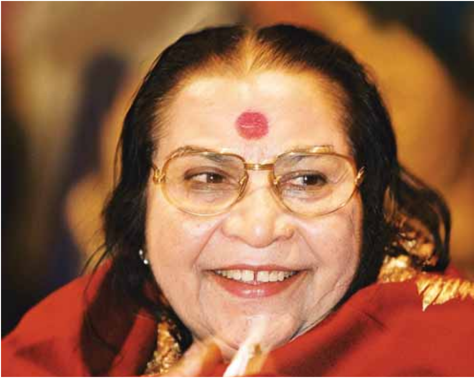
SAHASRARA PUJA • 6 MAY • CABELLA LIGURE ITALY

So many years have passed. I have worked quite hard, day and night, and My only desire was that you people should take it seriously and work it out.