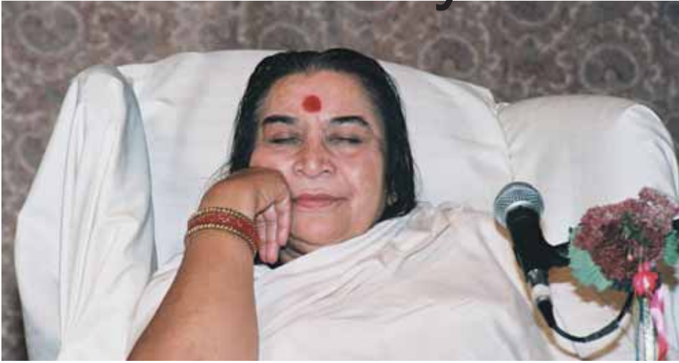
GURU PUJA • 28 JULY • CABELLA LIGURE