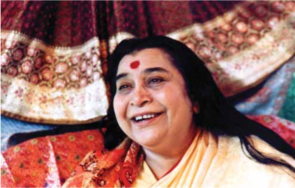
SHRI ADI SHAKTI PUJA • 3 AUGUST • TOGLIATTI RUSSIA

These are the special times. I call them the blossomtime when so many flowers are there who are seeking the truth. And their fragrance is their love. They had to all become fruits now and this is what is going to happen, as these times are very, very important.... This is the power by which a drop becomes the ocean, an individual becomes the collective.