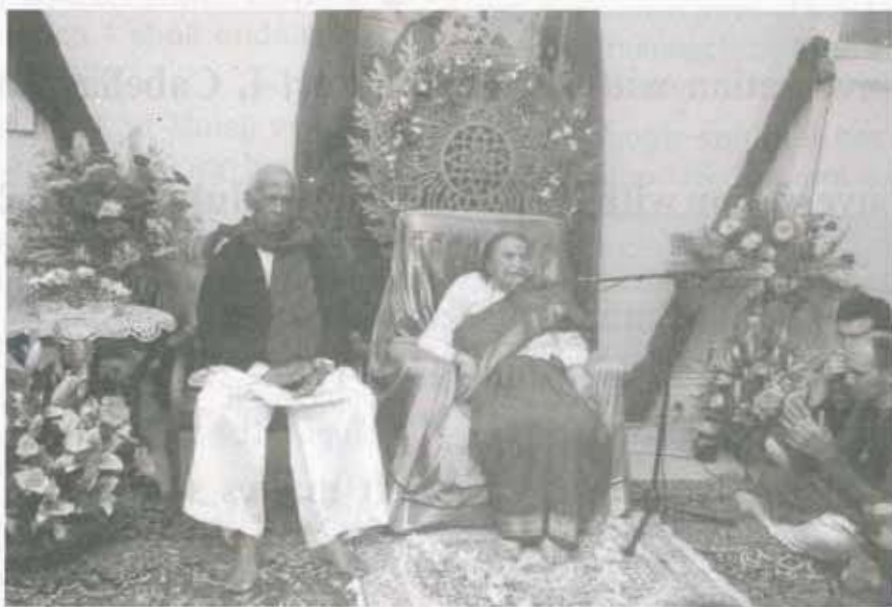
Navratri Puja, Australia-2007