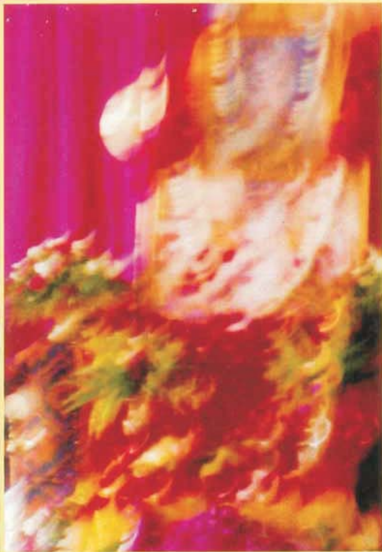
सहजयोग केन्द्र बड़ीच-जनापद (बागपत), ३०५० में पूजा के उपसंकेत लिया गया फोटो