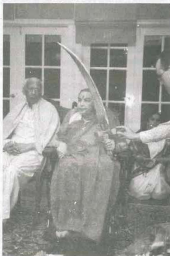
Navratri Puja, Australia-2007