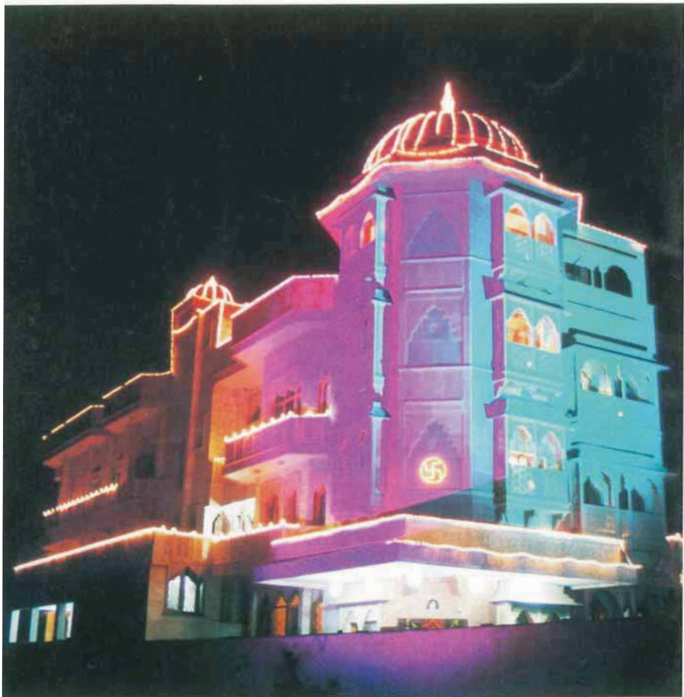
Pratisthan, Gurgaon, India