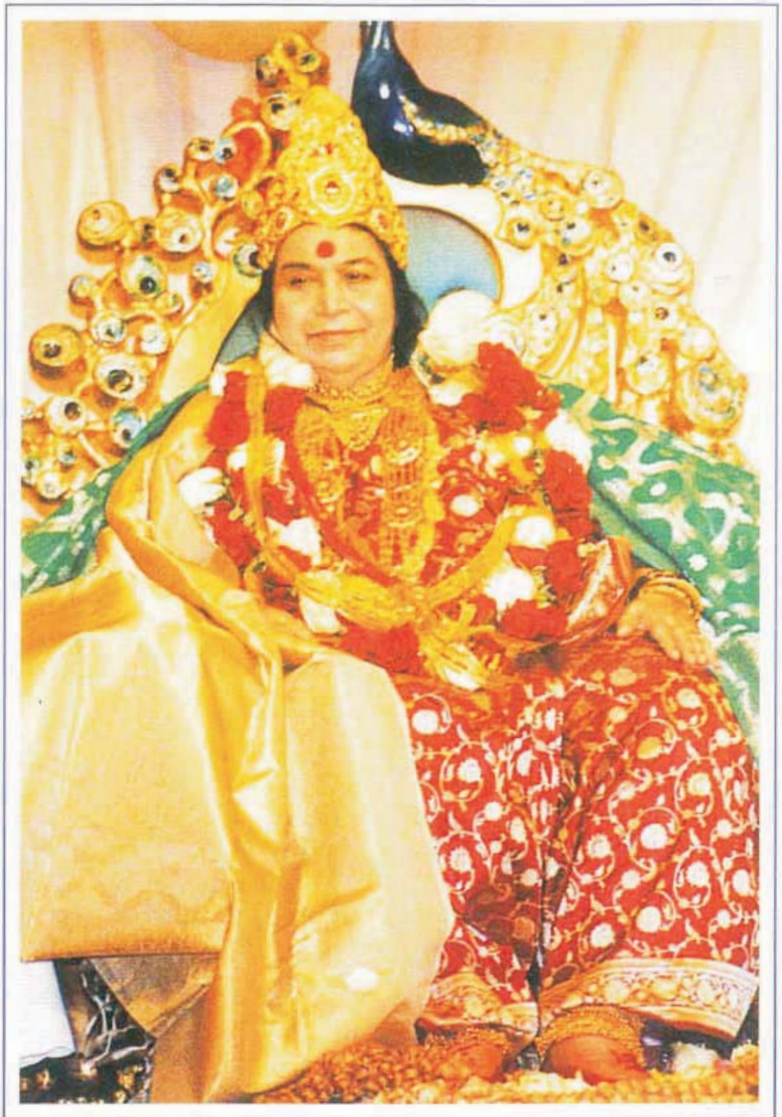
Guru Puja, Cabella, 8.7.2001