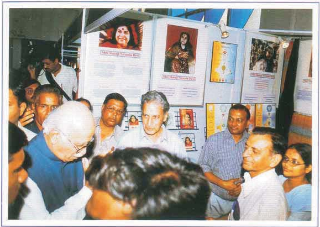
Union Home Minister Shri L. K. Advani visits Sahaja Yoga stall at Delhi Book Fair, 2001