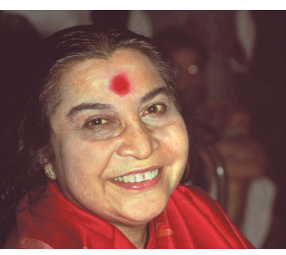
"This side needs heat. This side needs cooling. This is the basics."