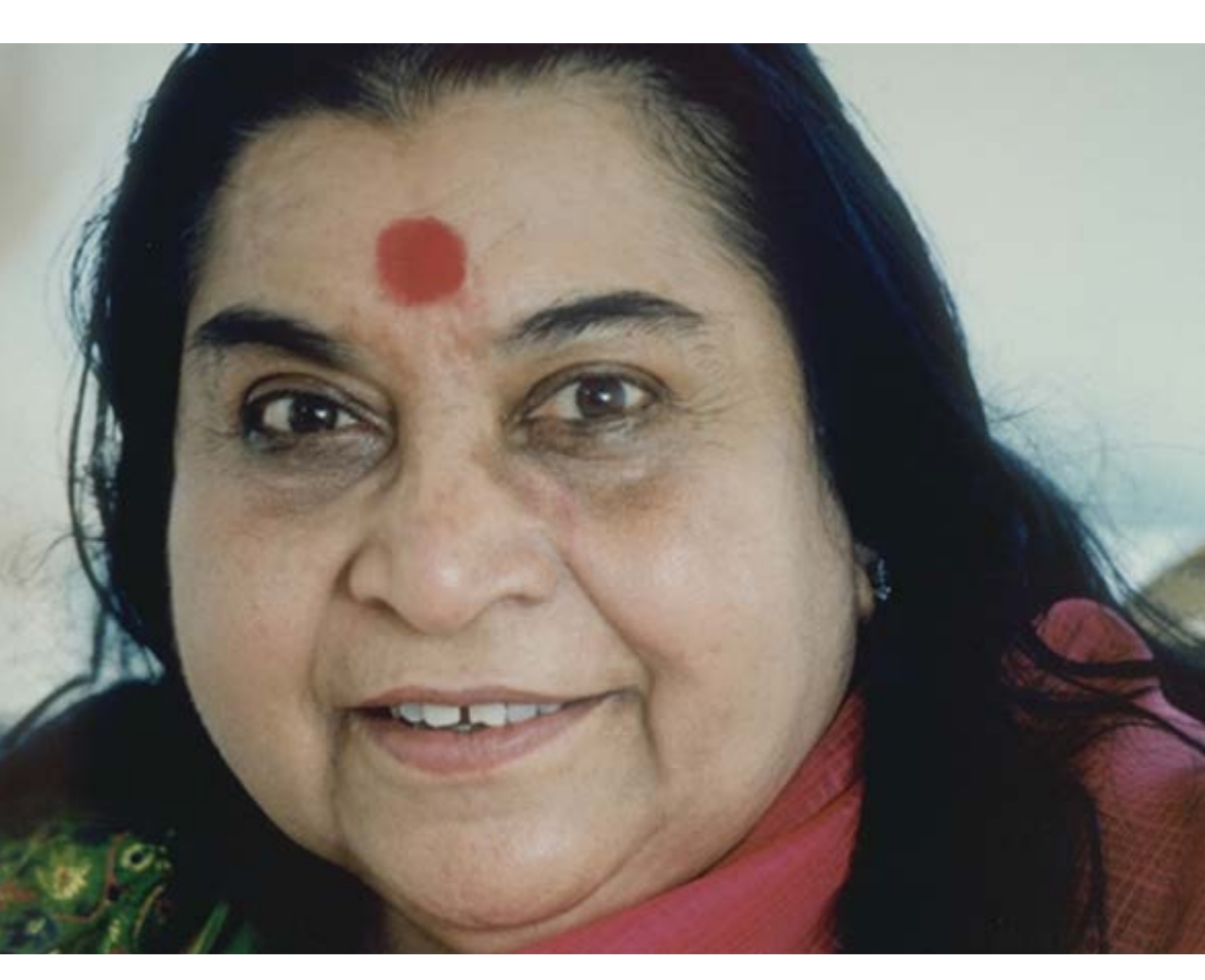
"A healthy body is the temple of God, and the temple of God you have to keep healthy and happy. That is the attitude."